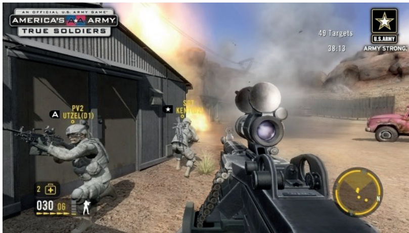
Figure 4. America's Army.