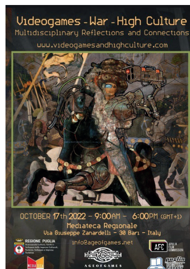
Figure 1. Poster Conference Video Games—War—High Culture (2022).

In the sixties, the book was rediscovered by situationists, Provo, and other artistic and political avant-gardes, whereby the word “playful” derived from the book aptly expressed the playful basic attitude of that time. Huizinga's book was, to give just one example, an important source of inspiration for the New