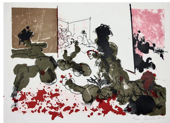
Figure 3. Constant, Massacre, 1972.

Anyone who had read Huizinga’s Homo Ludens carefully would not be surprised. In spite of the title, Homo Ludens is by no means a cheerful book. Not only is the chapter “Play and War” entirely devoted to the theme of war, but the book also ends with a gloomy diagnosis of Western culture, which, according to the author, threatens to fall into the “barbarism and chaos,” of which World War I (1914–1918) offered a first manifestation. Huizinga crosses swords again—after he had opened the attack in In the Shadow of Tomorrow (Huizinga 1936), originally published in Dutch in 1935—with Carl Schmitt, the later “crown lawyer” of the Third Reich, who, according to Huizinga, “warfully reduces all real political relations between peoples and states to ‘the “friend-enemy” principle’” (Huizinga 1955, 209).