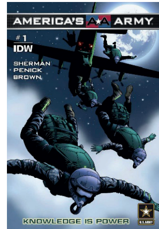
Figure 5. America's Army Comics.